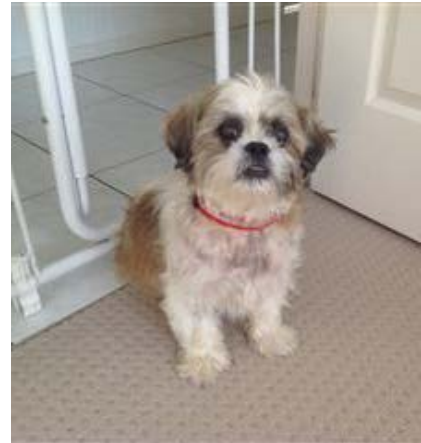
The baby gate was accidentally left open and Buddy is on the wrong side of it. Keep baby gates closed.

The 'umbilical method' is another choice. Put the dog on a leash. Put a belt around your waist and attach the dog. Your dog is now in the position of having to be with you at all times and you can have constant supervision of him at all times.